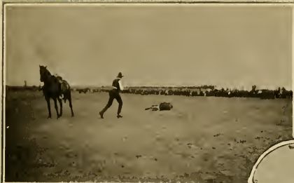
PONY HOLDING DOWN STEER.